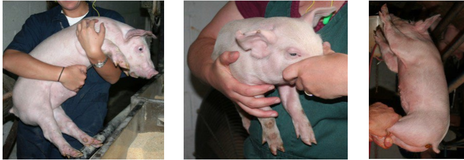
Figure 3. Various Restraint Techniques for Smaller Pigs