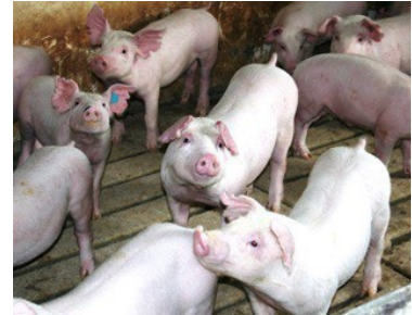
Figure 1. Engage a pig's natural curiosity to manage handling.