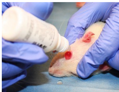
Figure 1. Apply Topical Anesthetic