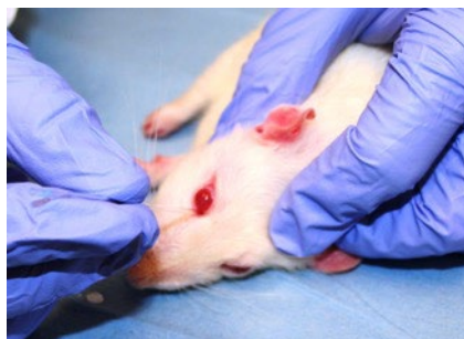
Figure 2. Insert Capillary Tube