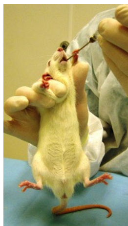
Figure 5. Introducing the Gavage Needle