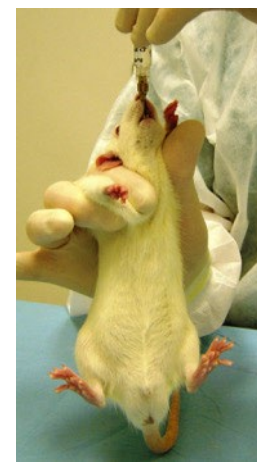
Figure 7. Ready for Administration