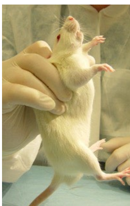
Figure 4. Restraint