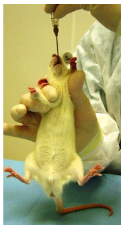
Figure 6. Insertion, Straightening Position