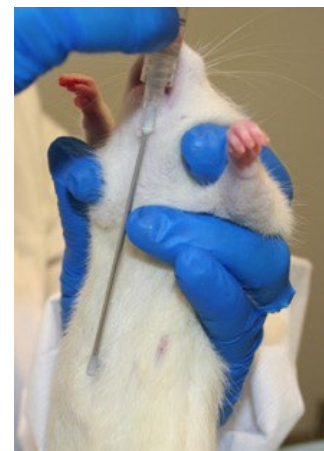
Figure 3. Measuring the Gavage Needle