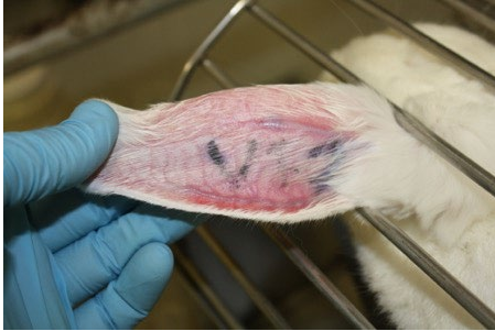
Figure 3. Visualize marginal ear vein