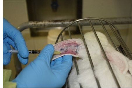
Figure 4. Insert needle, draw back gently on plunger of syringe and watch for flash of blood in hub of syringe