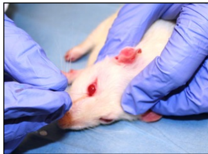
Figure 2. Insert Capillary Tube