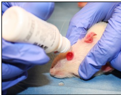
Figure 1. Apply Topical Anesthetic