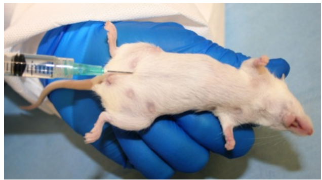
Figure 1. Landmark Identification, Restraint, and Administration of IP Injection