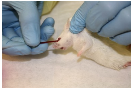
Figure 3. Blood Collection