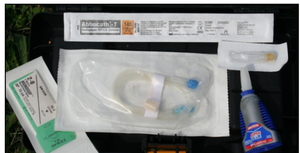
Figure 1. Catheter Supplies