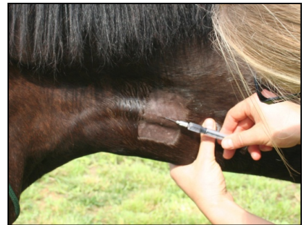
Figure 2. Inject Lidocaine