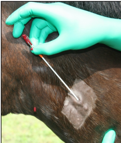
Figure 3. Insert Catheter and Watch for Blood Flash